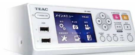
Surgical video recorder