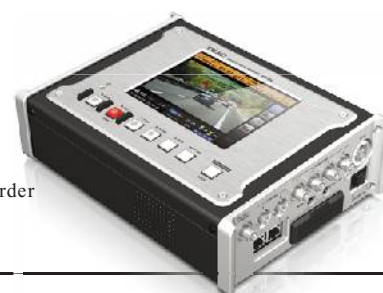
Video NV Recorder

The device is designed for use under harsh conditions, so it features durable, compact and light weight design, as well as low power consumption. Perfectly fulfilling all of the requirements for passenger planes.