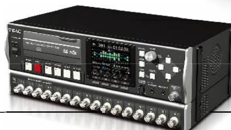
Wideband Data Recorder